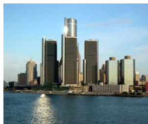
Coming Together and Making a Difference

The purpose of the MDA is to “be a diverse and unified community of faith dedicated to carrying out God’s mission.” To help facilitate this belief we have begun an exciting new section in The Update and on the MDA website ( www.metrodetroitassoc-abc.org ) called Church Connections . If your church has an activity or event that you would like to advertise to your fellow MDA churches we are here to help! Information must be received by the 1st of every month to be published in the newsletter. It is recommended that website information is received 2-3 weeks before event. The MDA is a free source of advertisement for your church so don’t forget to send in your information!